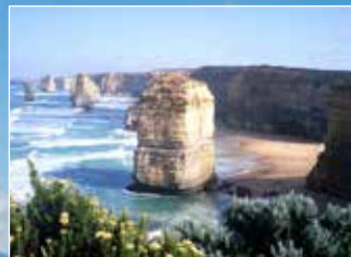
Great Ocean Road